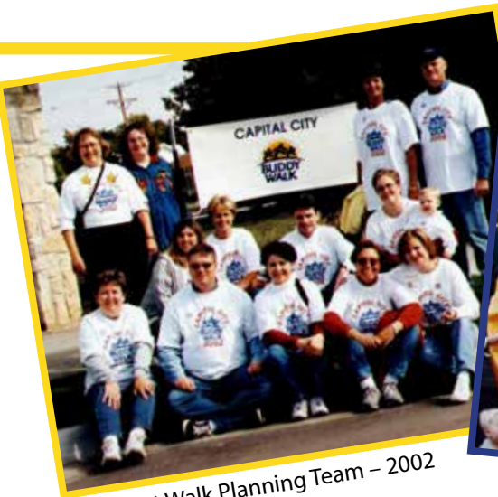
First Walk Planning Team – 2002