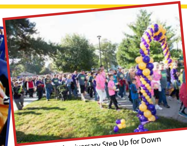
15th Anniversary Step Up for Down Syndrome Walk – 2016

Medical Outreach, Scholarships, and Donations. And members were officially appointed as representatives of a documented Board of Directors.