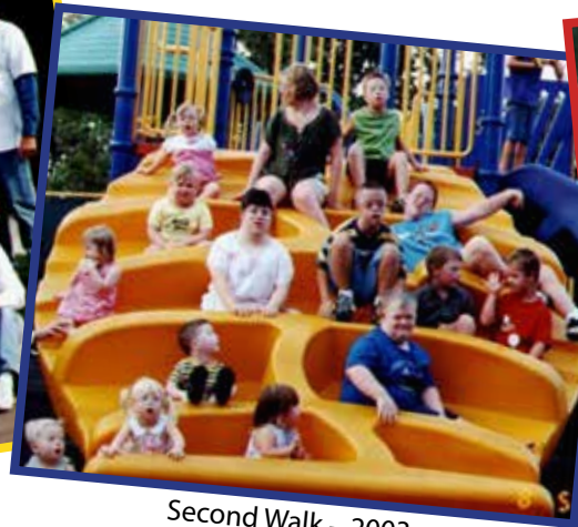
Second Walk – 2003