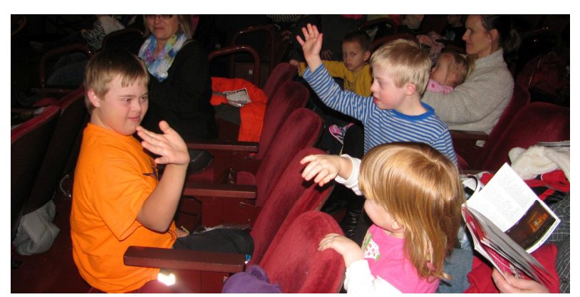
2nd Annual Trip to the Children's Museum